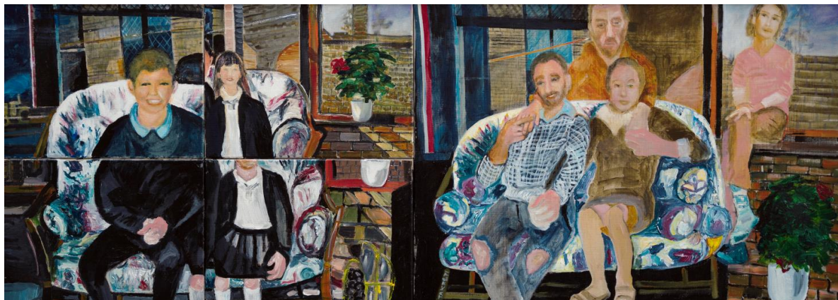
Décalé - Décalage #1

Love is the one who collected the scraps of his memories and created this group embalmed in the colors of optimism and hope.