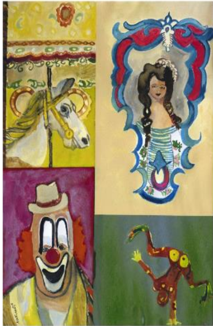
#8 LOVE Water color, gouache, acrylic on canvas 73 x 53 cm 2022