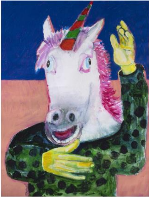
#11 LOVE Water color, gouache, acrylic on canvas 62 x 48 cm 2022