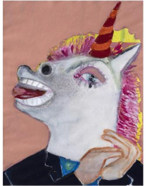
#7 LOVE Water color, gouache, acrylic on canvas 63 x 48 cm 2022