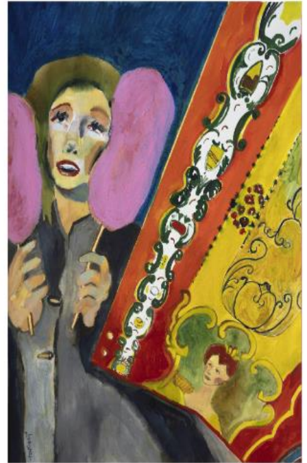
#15 LOVE Water color, gouache, acrylic on canvas 73 x 54 cm 2022