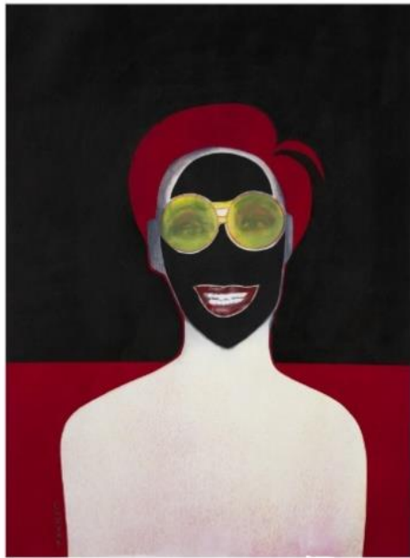
#2 LOVE Water color, gouache, acrylic on paper 2022