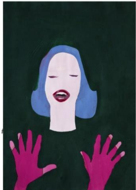
#4 LOVE Water color, gouache, acrylic on paper 2022