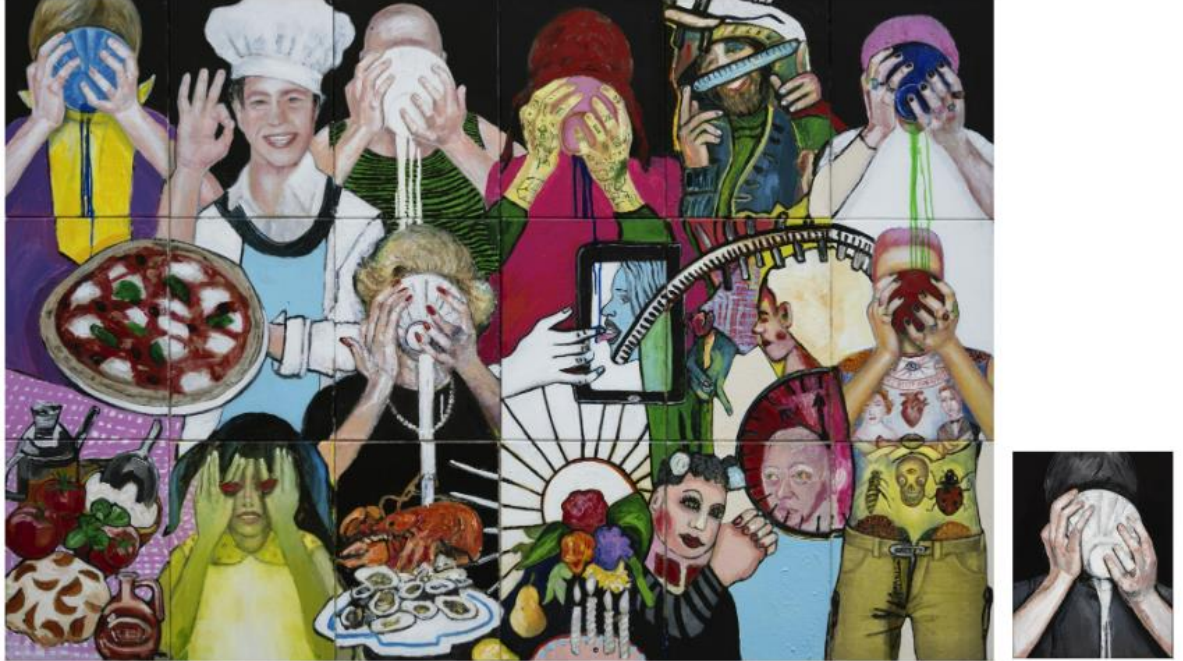
Beirut MOOD I